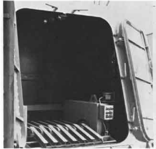
Rear loading station of a 175 lb. Vertiflo Deck House installation.