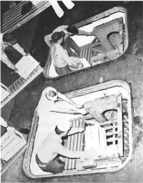
Two 85 lb. Vertiflos provide rapid strikedown of supplies transferred on an aircraft carrier. Flush deck installation.