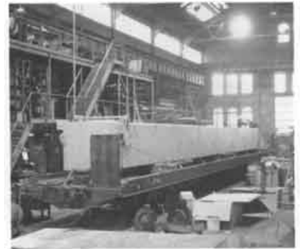
175 lb. trunk unit loaded for rail shipment on one of two interior rail sidings.