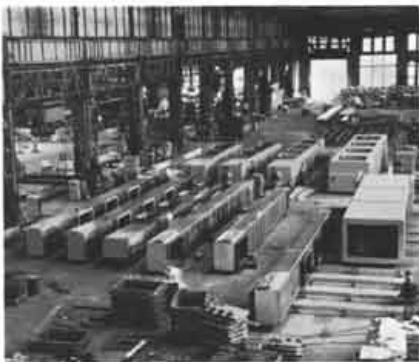
First US Navy trunk units for AF52