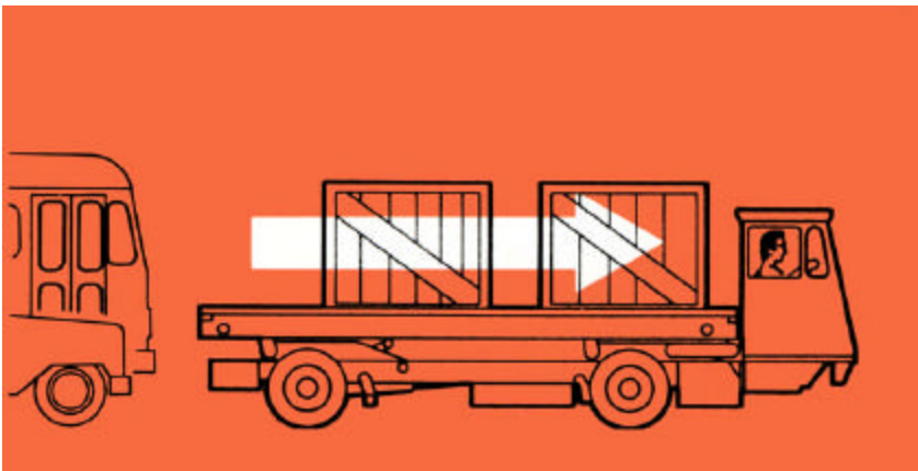
FOR OVER-THE-ROAD TRANSPORT, CAB'S IN FRONT POSITION