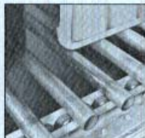
Rolls rest on Palletflo wheels which impart hysteresis control and irregularity compensation.