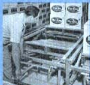
When pallet is empty, easy lever operation returns it to rear of rack for fork truck pickup. Pallet No. 2 is held back during this operation.