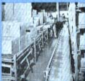
Fast movers picked directly from pallets on Palletflo. Note narrow aisle, Armorhelt conveyor and Cartonflo rack at right for slow movers.

Order Picker Palletflo is the ideal rack for fast moving items. It is easily combined with Cartonflo racks and conveyors for rapid, flow line order filling directly into waiting trucks. The Empty Pallet Return eliminates all manual handling of heavy pallets. Order pickers are isolated from replenishment activity. The narrow aisle reduces manual effort. Walking and searching is minimized. This development, pioneered by Kornylak in 1959, is the versatile manual order picking system which permits you to delay picking until the truck arrives and save the warehouse floor space normally reserved to store prepicked orders.