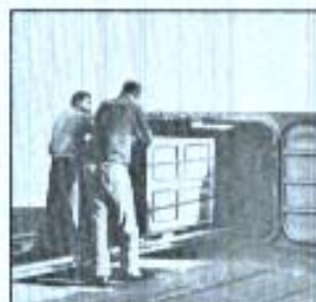
Ammunition container is pushed into a Navy elevator equipped with standard rail latches.