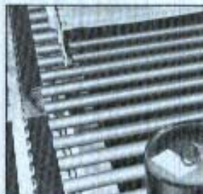
Pails, drums and metal skids with narrow bottom surfaces move easily on Rim Runner.

Some items are not suitable for conveying on wheels. Formed steel skids have narrow runners, pails and drums have chimes which project beyond the bottom surface. These and other problem items are conveyed at hysteresis controlled speeds on Rim Runner. They are conveyed on steel rolls which furnish the needed support. The rolls rest on Palletflo wheels to obtain the "give" needed to compensate for irregularities in the load surface and for the smooth Palletflo speed control. Ask for Bulletin 272.