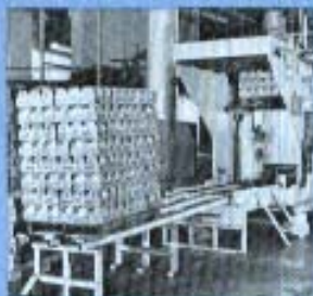
Pallets accumulate gently on Palletflo rails as they leave the palletizer. Accumulator can be 2 to 5 pallets long.

It is easy to increase productivity of your palletizing operation. A Palletflo Accumulator at the discharge of the palletizer holds pallet loads in line for convenient pickup by fork truck. Thus the palletizer does not stop for a fork truck to remove the stacked pallet and the fork truck driver never has to wait for the palletizer to complete a load. Pallet Accumulator's gentle control protects the load against shifting or spills, even when the load is loosely stacked. The Accumulator kit consists of 10' Palletflo rails and supports. Ask for Bulletin 232.