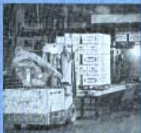
Fork truck drivers never wait for a pallet and palletizer never stops for truck pickup.