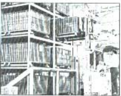
Palletflo in-process storage of parts boosts productivity and simplifies inventory control.