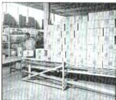
Order picking direct from pallets. Palletflo racks return empty pallets to rear for truck pick up. Replenishment of rack is also at rear for picker's safety and undisturbed productivity. Picker places carton on Armorbelt ® conveyor with very little effort. Rack in background is Cartonflo ® containing slow movers.