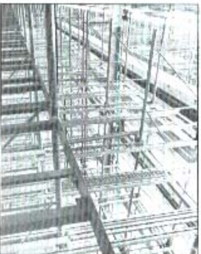
High cube live storage possibilities of Palletflo are dramatized in this installation photo.