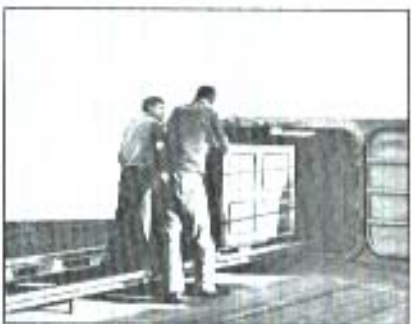
Shipboard Palletflo Pushline systems move loads without use of fork trucks. Here a 4000 lb. ammunition pallet is loaded into an elevator.