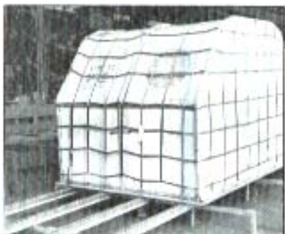
14,000 lb air cargo load rolls at controlled speed on Palletflo line. Aluminum pallet is gently supported on elastomeric Palletflo wheels with no indentation or scratching.