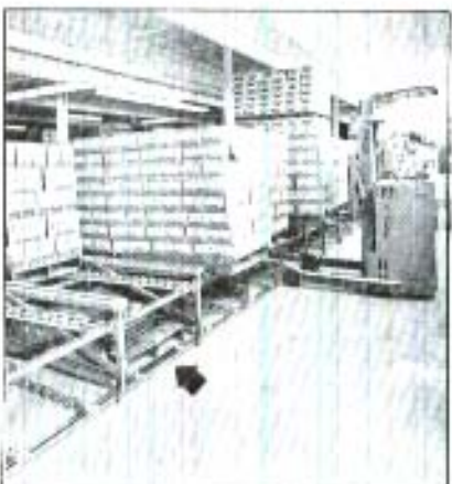
When an empty pallet returns to the rear of a Palletflo order picking rack, it is easily removed by the same truck which replenishes the rack. This entirely eliminates manual handling of heavy pallets in the Palletflo system.