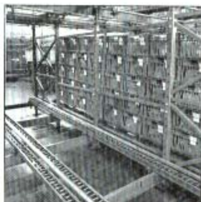
Special Palletflo rails handle molded plastic containers.