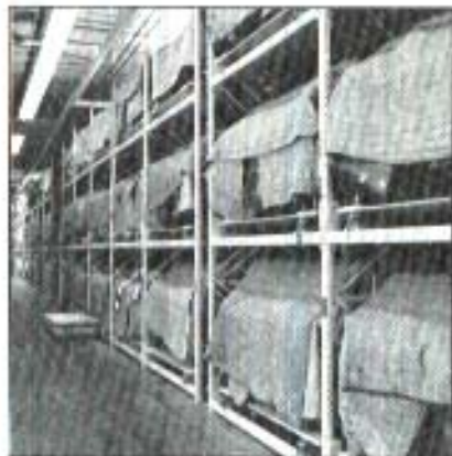
Picking face of a piano storage Palletflo.