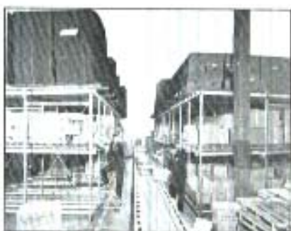
Two-level order picking from Palletflo for a restaurant chain. The third tier is last-in first out with access to the pallets of flat cartons from rear of rack.