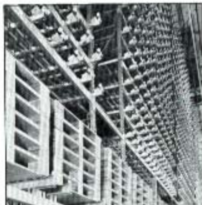
25,000 precooked meals stored in freezer Palletflo at Australian hospital.

Palletflo was the pioneer in pallet live storage. Thousands of installations serve industry throughout the world. Its success is based on the ability to handle almost any pallet and the smooth speed control resulting from the Hysteresis control built into every wheel. Palletflo adds economy because there is no need for power, braking devices, special pallets, and rehandling of loads and pallets when transferring from receiving pallets to special pallet to shipping pallet. Its simplicity and versatility make it easy to apply - whether the need is for a single lane to accumulate the output of a palletizer or a complete high rise warehouse. In the years since it gave industry its original break-thru into pallet live storage, Palletflo has proven its versatility - handling loads of pallets and skids of almost all types in as-is working condition, loads ranging from an empty pallet to 14,000 lb. of air cargo, in runs over 100 feet, at temperatures ranging from -40°F to +130°F. A few of these interesting installations are illustrated.