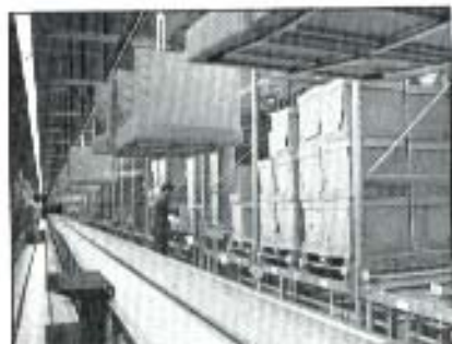
Order picker fills orders directly from palletized cartons with front opening flaps.