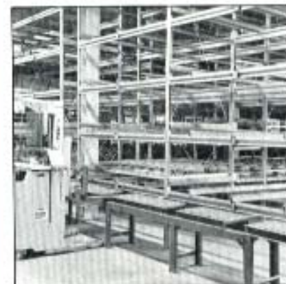
Live storage of cores ups productivity in automotive foundry.