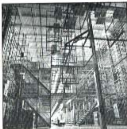
World's largest textile item order picking system combines Palletflo, Cartonflo and stackers in an integrated 3 floor level system. 1 million items in live storage permit rapid response to orders.