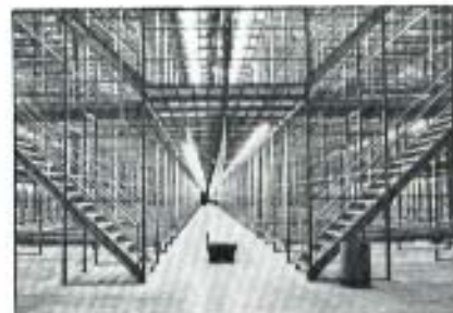
Order picking from Palletflo on both sides of conveyor on ground floor and second and third level mezzanines above. Conveyors move picked orders to shipping. Palletflos are loaded by stacker.