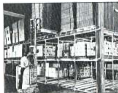
Last in - first out feature on top shelf allows access to shipping supplies from rear of a Palletflo order picking rack.