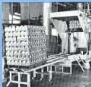
Pallets accumulate gently on Palletflo rails as they leave the palletizer. Accumulator can be 2 to 5 pallets long.

It is easy to increase productivity of your palletizing operation. A Palletflo Accumulator at the discharge of the palletizer holds pallet loads in line for convenient pickup by fork truck. Thus the palletizer does not stop for a fork truck to remove the stacked pallet and the fork truck driver never has to wait for the palletizer to complete a load. Pallet Accumulator's gentle control protects the load against shifting or spills, even when the load is loosely stacked. The Accumulator kit consists of 10' Palletflo rails and supports. Ask for Bulletin 232.