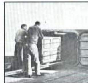
Ammunition container is pushed into a Navy elevator equipped with standard rail latches.