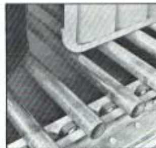
Rolls rest on Palletflo wheels which impart hysteresis control and irregularity compensation.