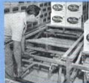
When pallet is empty, easy lever operation returns it to rear of rack for fork truck pickup. Pallet No. 2 is held back during this operation.