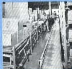
Fast movers picked directly from pallets on Palletflo. Note narrow aisle, Armorbelt conveyor and Cartonflo rack at right for slow movers.

Order Picker Palletflo is the ideal rack for fast moving items. It is easily combined with Cartonflo racks and conveyors for rapid, flow line order filling directly into waiting trucks. The Empty Pallet Return eliminates all manual handling of heavy pallets. Order pickers are isolated from replenishment activity. The narrow aisle reduces manual effort. Walking and searching is minimized. This development, pioneered by Kornylak in 1959, is the versatile manual order picking system which permits you to delay picking until the truck arrives and save the warehouse floor space normally reserved to store prepicked orders.