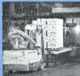
Fork truck drivers never wait for a pallet and palletizer never stops for truck pickup.