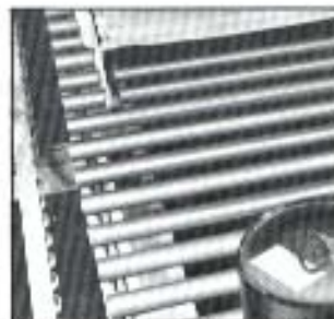
Pails, drums and metal skids with narrow bottom surfaces move easily on Rim Runner.

Some items are not suitable for conveying on wheels. Formed steel skids have narrow runners, pails and drums have chimes which project beyond the bottom surface. These and other problem items are conveyed at hysteresis controlled speeds on Rim Runner. They are conveyed on steel rolls which furnish the needed support. The rolls rest on Palletflo wheels to obtain the "give" needed to compensate for irregularities in the load surface and for the smooth Palletflo speed control. Ask for Bulletin 272.