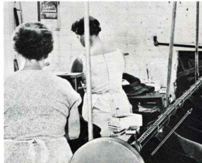
Operators mark buttonholes and place garments on Monoflo Conveyor for delivery to floor below.