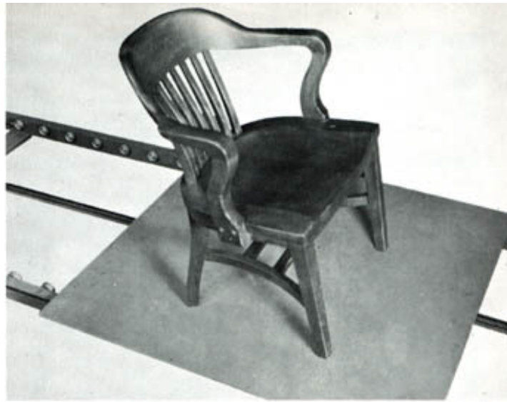
Monoflo permits movement of furniture and other items on pallets in any desired path. Loading, unloading, and stopping for operation can be done at any point.