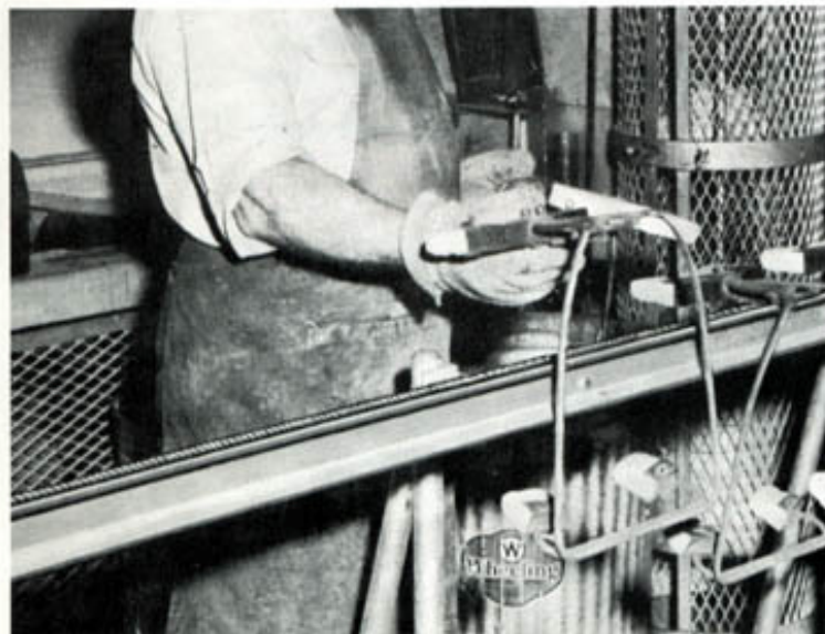
TV picture tube holders are returned to loading end of oven on a Monoflo Conveyor.