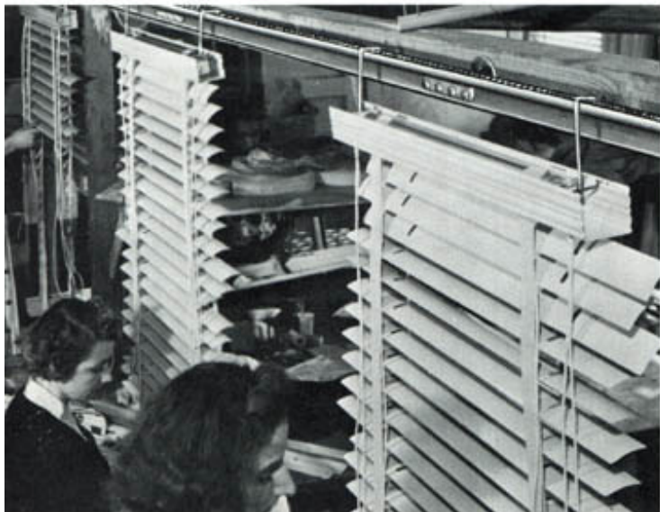
Venetian Blind assembly is mechanized by a low cost Monoflo line.