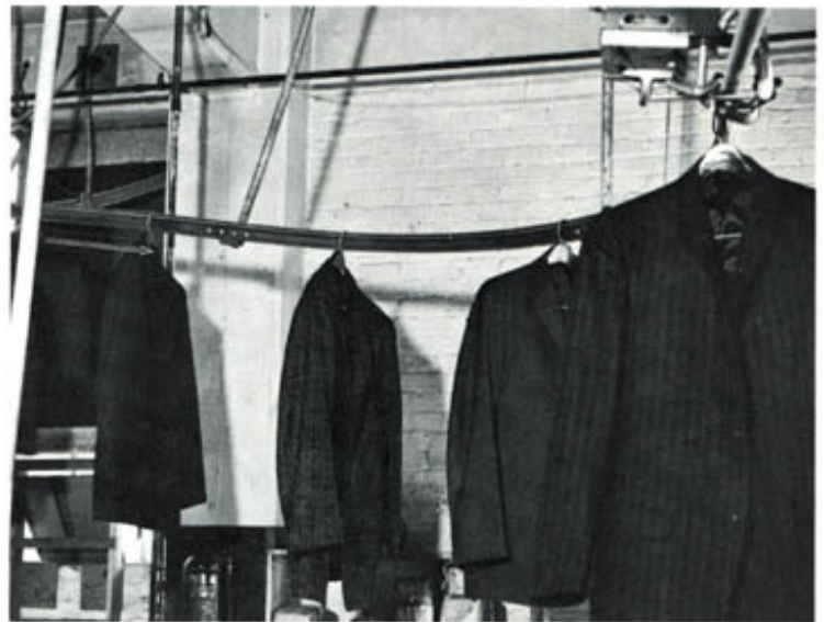
Monoflo Conveyor delivering garments from floor above to a slick rail. Automatic counter keeps record of the number of items transferred to the storage rail.