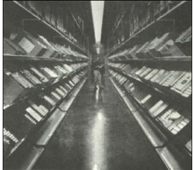
An award winning Cartonflo installation speeds order filling for a famous publisher